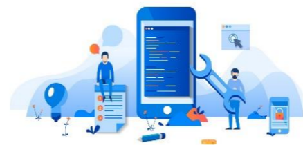
Mobile App Development