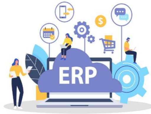
ERP and CRM