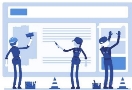
Web Development and Design