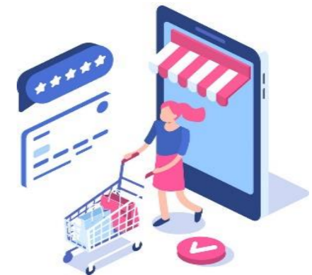
eCommerce Platform Design and Development